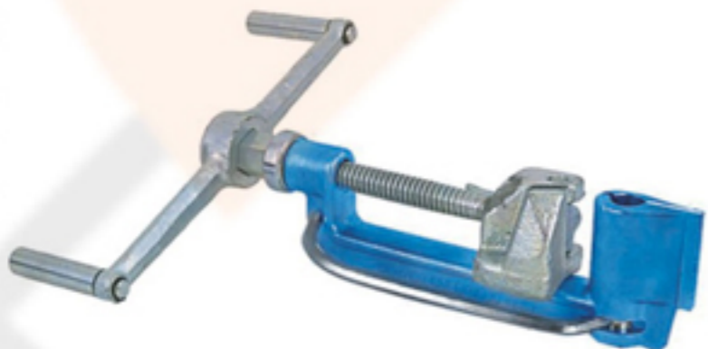
STTA1 Band Clamp Tool