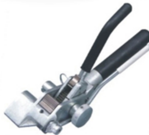
STTB1 Ratchet Tension Tool