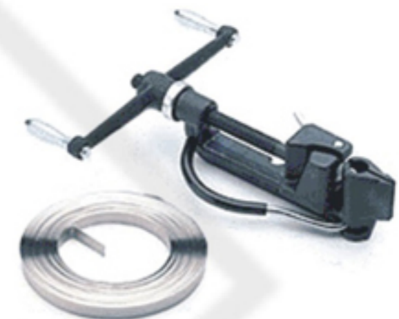
STTA2 Heavy Duty Tool